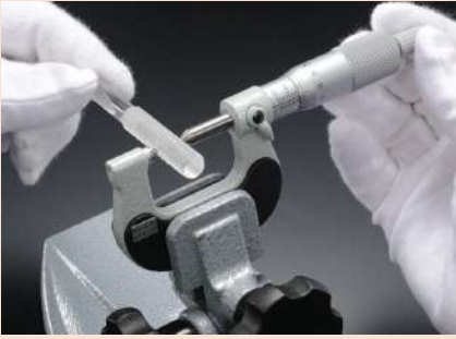
Standard Accessories Spanner (301336), 1 pc.